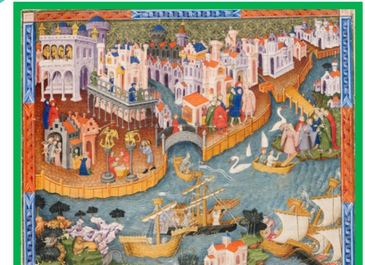
Marco Polo's Travels

What was significant about Marco Polo's exploration of the East?