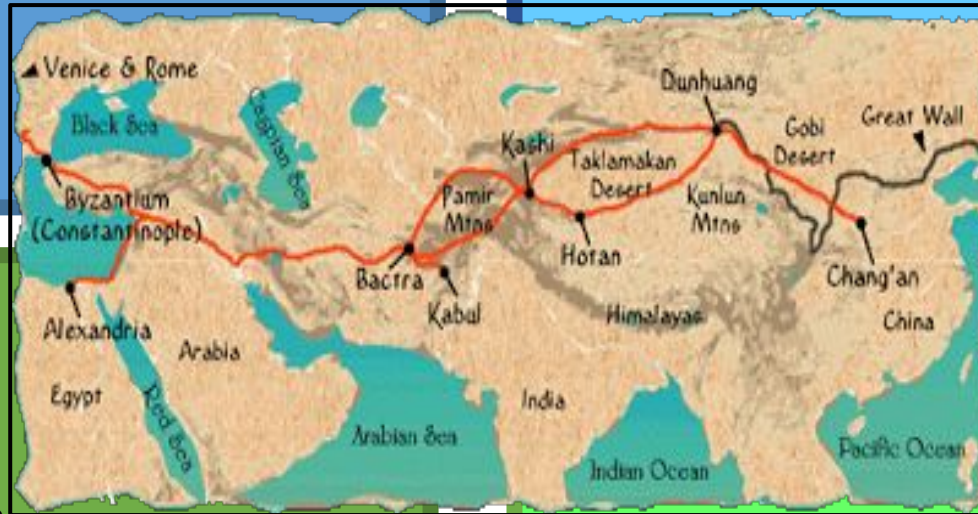
Marco Polo's route to the East

Useful links: https://www.youtube.com/watch?v=PN0tFwBmBeQ https://www.pbslearningmedia.org/resource/ff32837d-b085-40d4-8d60-ac9a676cb857/marco-polo-pbs-world-explorers/https://kids.britannica.com/kids/article/Marco-Polo/353651