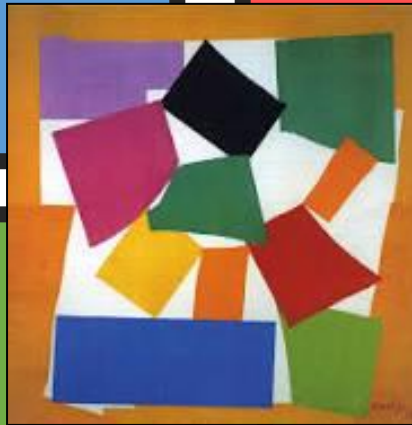
The Snail by Henri Matisse

Snails information: https://youtu.be/c8ma6vDvXAM