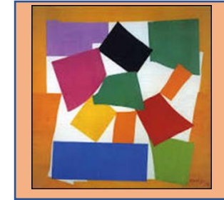
The Snail By Henri Matisse

This week, you are going to create work in order to show the Characteristics of Effective Learning : What inspired this painting ? What inspire you?