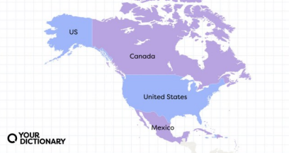
Countries of North America