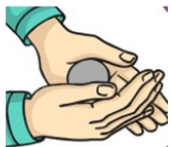
Rolling a ball of clay