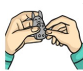
Joining pieces of clay together