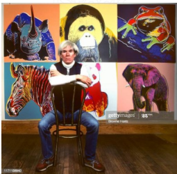
Andy Warhol 1928-1987

Secondary colours —a secondary colour is created when 2 primary colours are mixed together.