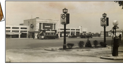
Morden Station in 1927