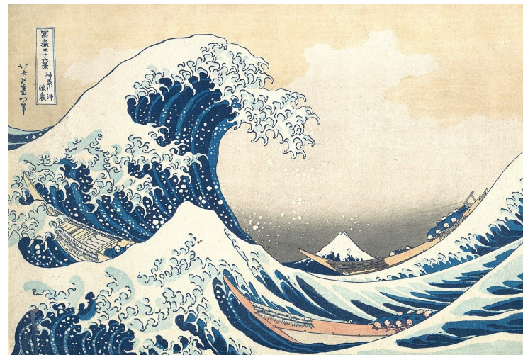
The Great Wave of Kanagawa (1829-1832), also known as 'The Great Wave' or 'The Wave'.

This is Hokusai's most famous piece. One of 36 prints from the work 'Thirty Six views of Mount Fuji'.