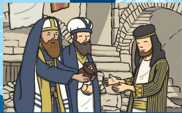
Judas betrayed Jesus for money