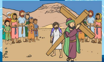
Simon carried Jesus' cross to the hill