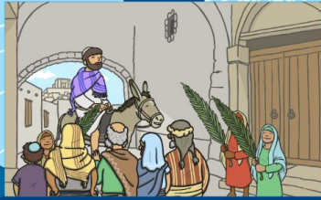
Jesus arrived in Jerusalem on Palm Sunday