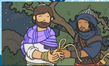
Judas told the high priests where Jesus was and they sent the temple guards