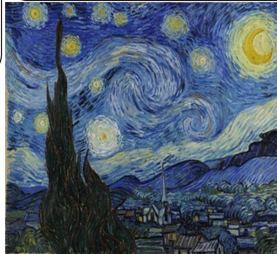
The Starry Night (1889) Oil on canvas